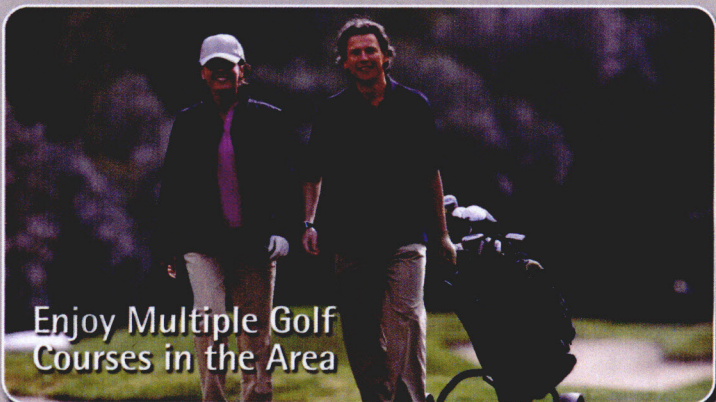
Enjoy Multiple Golf Courses in the Area