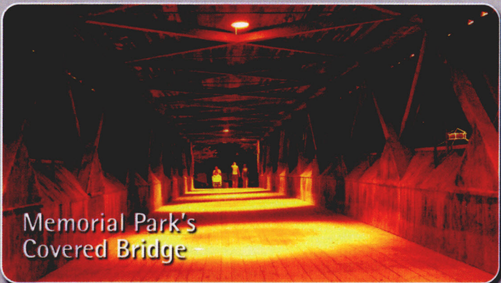
Memorial Park's Covered Bridge